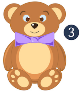
1. penguin 2. raccoon 3. bear 4. quail 5. fish 6. monkey