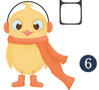
1. raccoon 2. penguin 3. chicken 4. lion 5. hamster 6. toucan